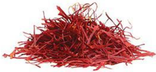
PRESSED SUPER NEGIN