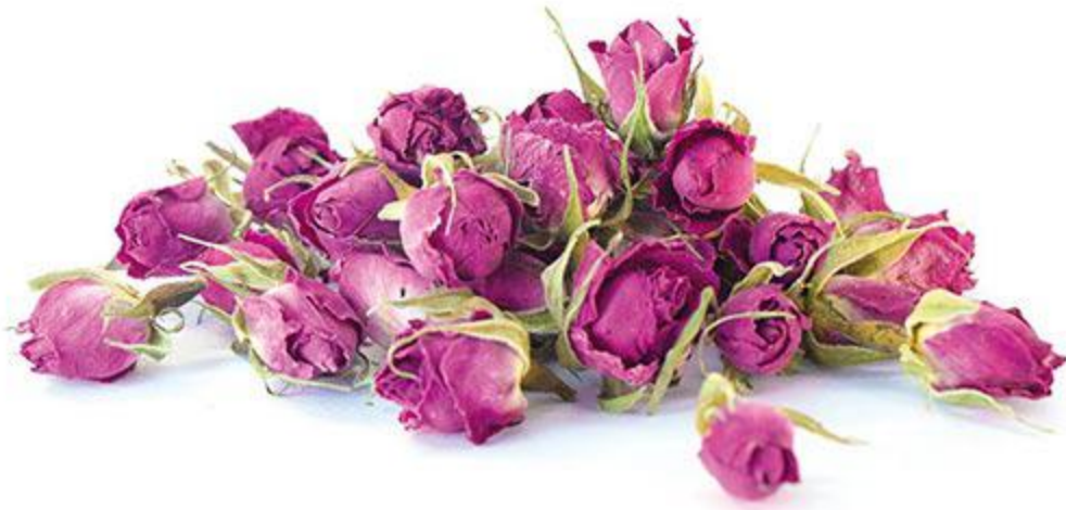
DRIED ROSE BUDS