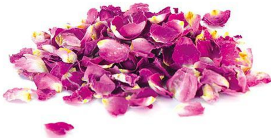
DRIED ROSE PETALS